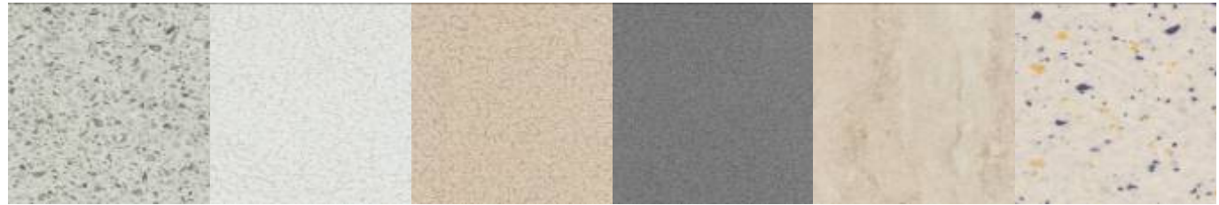
6060 COMPOSITE WHT—GS 5016 INTAGLIO PANNA—C 5014 INTAGLIO VANIGLIA— 5015 INTAGLIO CAFFÈ —C 5534 TRAVERTINO —C 921 GALAXIS —C

*Please inform us when you have selected our products so we can assure that material is available and can be supplied to suit your project deadlines .