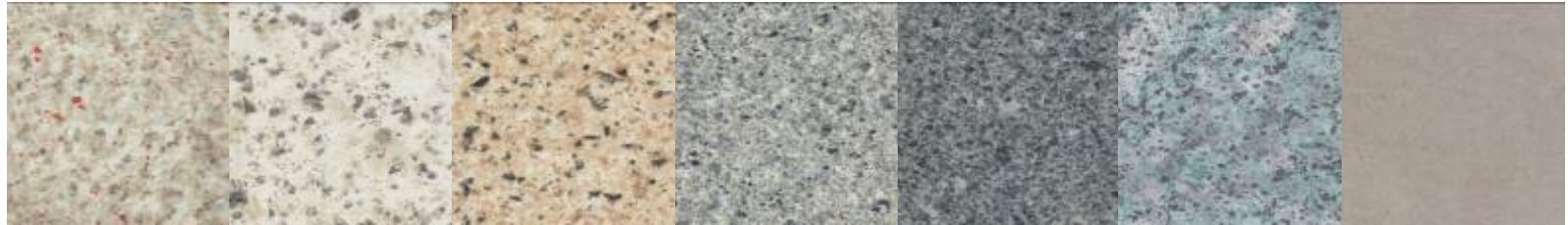
5539 KASHMIR —C 596 PHARTENON GRIGIO — 6038 TAURUS —C 5505 FIESTA BIANCO —C 5503 FIESTA VERDE —C 5515 HUDSON BLEU —C 926 SERENGETI —C