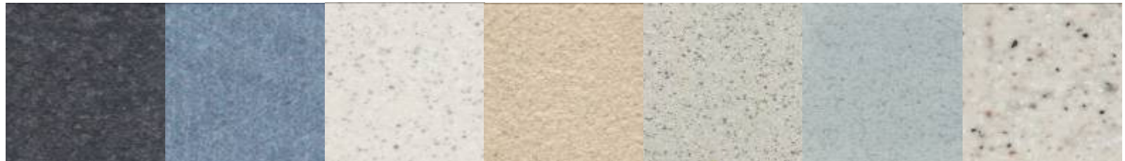
6054 PORFIDO —C 5509 CHINO BLEU —C 917 GRAINY BIANCO —C 6047 PLANET —SM 920 GRAINY GRIGIO —SM 912 GRIPER —SM 6042 QUARTZO WHITE —C