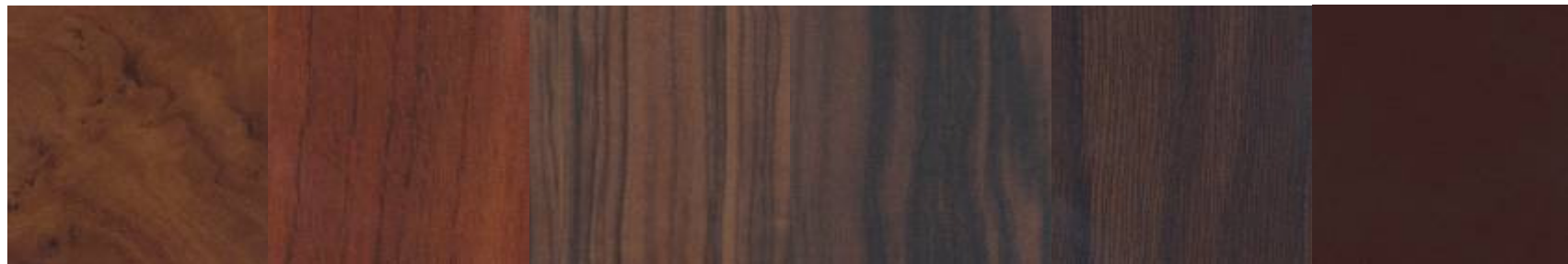
677 RADICA SPAZIALE-GS 673 ETIMOE ROSSO-GS 744 OLIVO-GS 664 MAKASSAR-GS 530 NOCE FIAMMATA-GS 1395 AMARANTO-GS