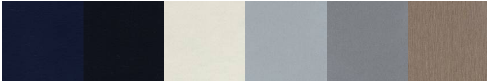
1544 BLEU NOTTE —GS 202 NERO —GS 5002 PEARL —GS 5012 METAL —GS 5011 GHISA-GS 5022 COPPER-GS