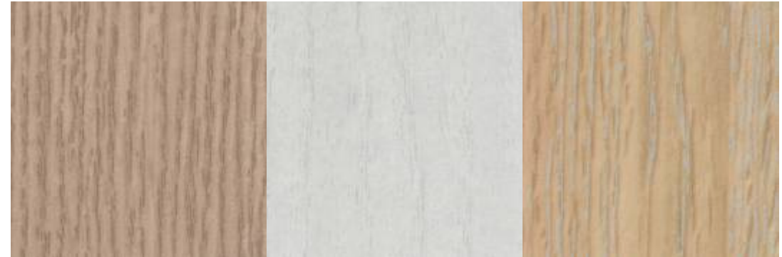
665 ROVERE CHIARO—WF